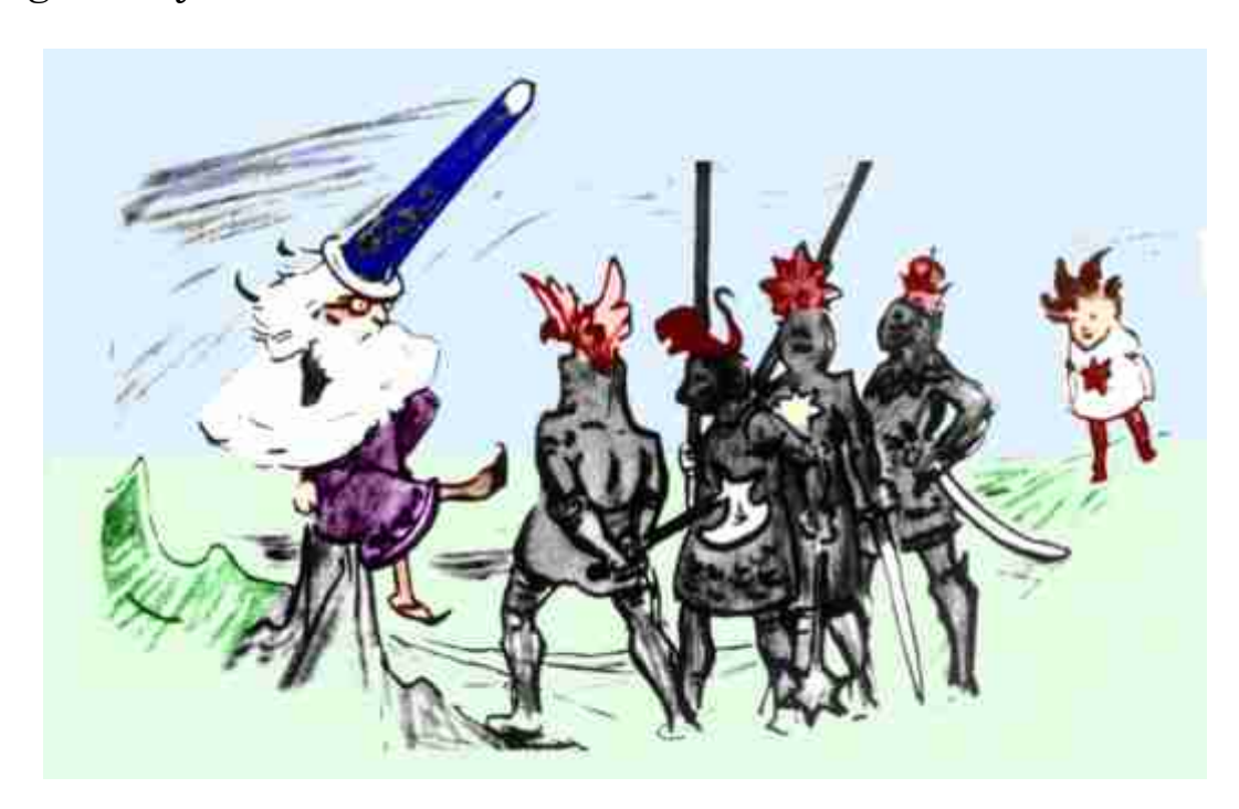
VERY OLD MAN

little boy once looked over the garden fence and saw four knights with enormous crests riding by. As he is now married to a Princess and moves in rather good society, he has desired me not to mention his name; so we will call him Redlegs. Being interested in such things he climbed over the fence and ran after the Knights to see where they were going. They came to a