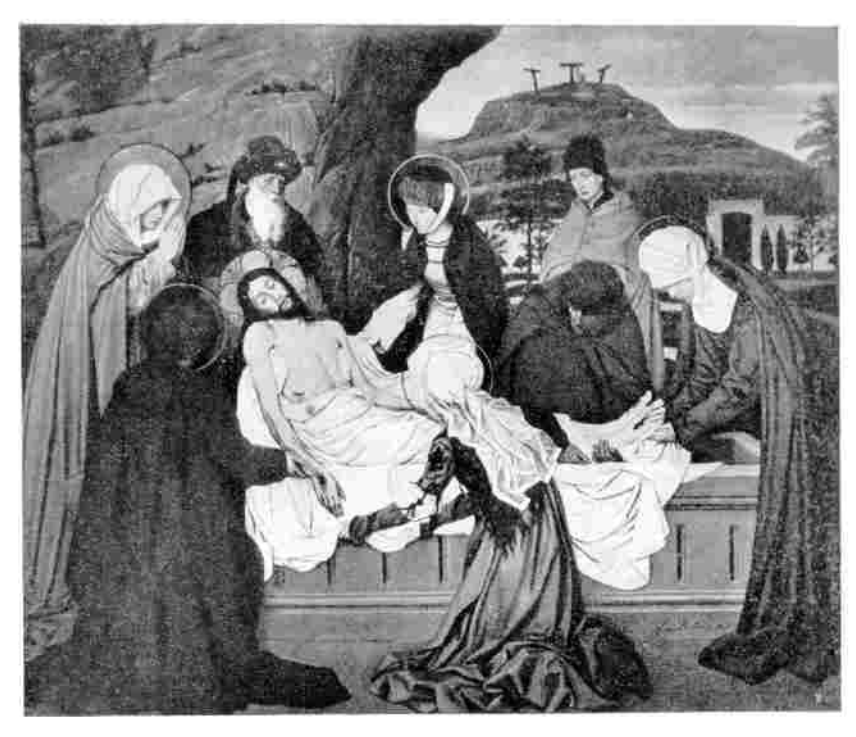
There they laid Jesus because the sepulchre was nigh at hand.—John xix. 12.

The disciples prepare the Sacred Body of Jesus for burial; place the Body in the tomb; seal it and depart from Calvary.