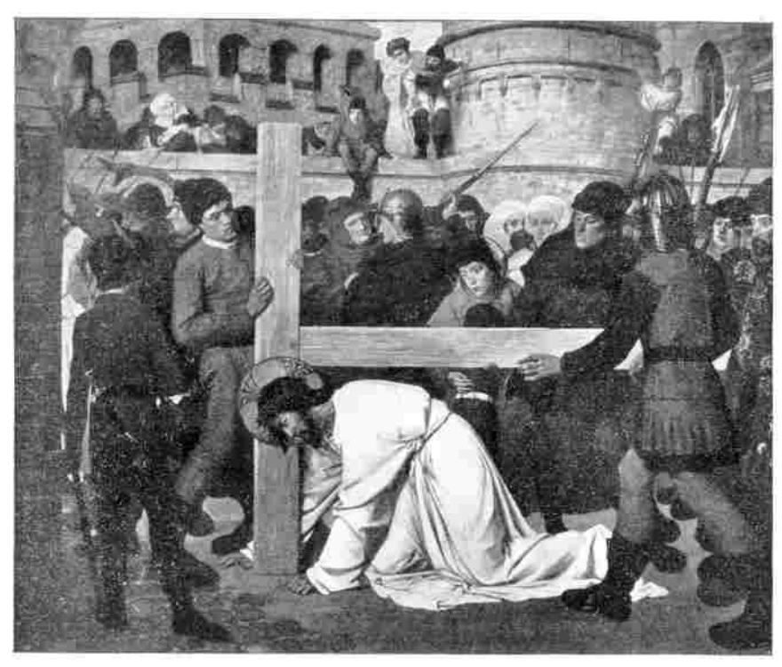
The Lord lifteth up all that fall, and setteth up all that are cast down.— Ps. cxliv. 14.

hough bearing it all with patience and resignation, the weight of the Cross is too great. Weakened by the cruel treatment of His enemies, by His scourging and His crown of thorns, Jesus' strength gives way and He falls.