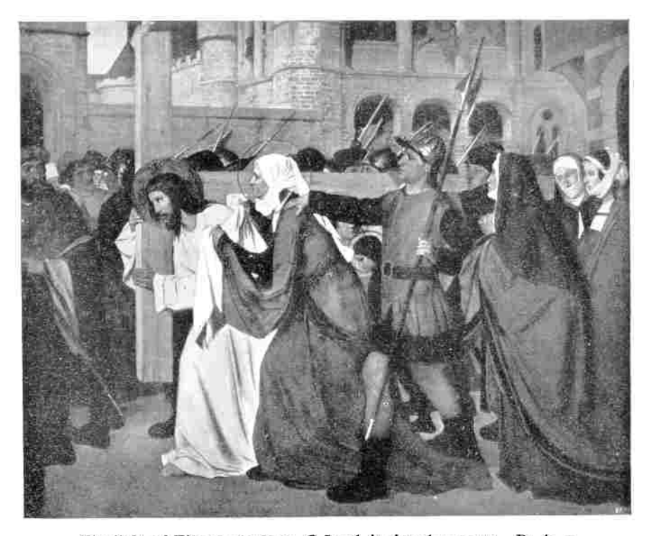
The light of Thy countenance, O Lord, is signed upon us.-Ps. iv. 7.

With His wounds still bleeding, His face dripping with sweat, Jesus struggles on. A woman of the crowd, Veronica by name, comes with a towel and mercifully wipes His Holy Face.