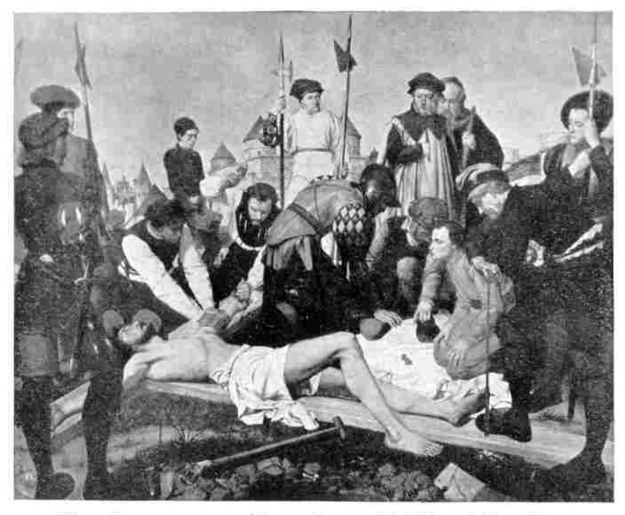
When they were come to Calvary, they crucified Him.-Luke xxiii. 33.

Jesus is placed upon the Cross. His limbs are mercilessly stretched and nailed with huge nails that cause Him unspeakable pain, and thus crucified, He is raised up on the Cross.