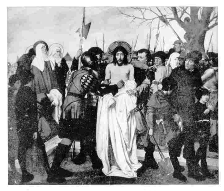
I will go stripped and naked .- Mi. i. 8.

In the presence of the multitude Jesus is shamefully stripped of His garments.