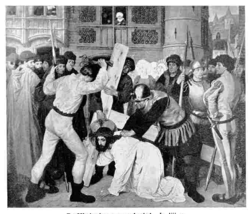
By His bruises we are healed.—Is. liii. 5.

Jesus becomes weaker and weaker; the Cross presses still more heavily. Again it overcomes Him and for a second time He falls helpless.