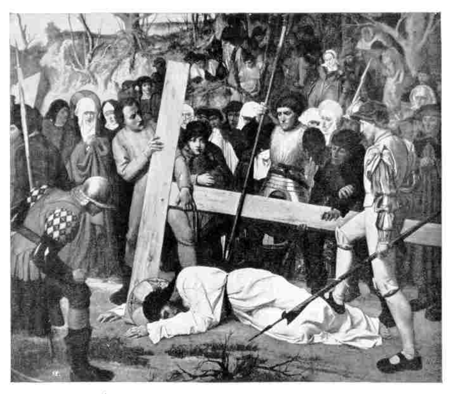
As one struck by God and afflicted.-Is. liii. 4.

Leavier and heavier grows the weight of our sins. That great piece of wood has worn His shoulders, sapped the strength from His body, and again, for a third and last time, it lays Him prostrate on the ground.